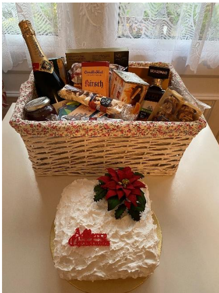
Federation Hamper with homemade Christmas cake