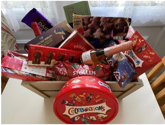
St Martins WI Hamper