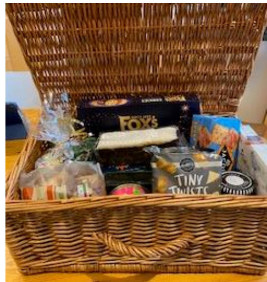
Catel WI Hamper

Catel WI, St Martins WI and the Federation sent hampers to the Wooden Spoon Online Christmas auction with the proceeds going to the Guernsey Welfare Service this year.