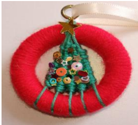
Ring Tree Decoration