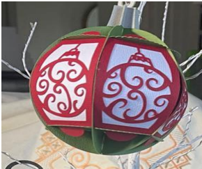
Fancy Card Bauble

Morning featuring these crafts and lots of others too 10-12:30 - £15