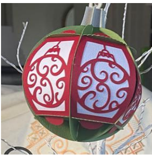
Fancy Card Bauble

Afternoon featuring these crafts and lots of others too 1:30-4 - £15