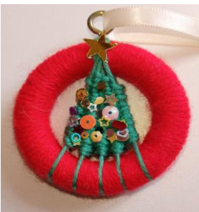
Ring Tree Decoration