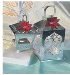
Card lantern with light