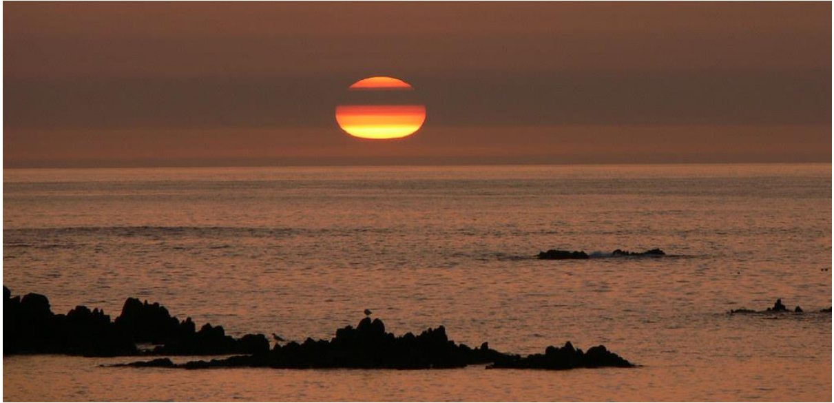
Sunset at Cobo

Congratulations to our newest WI the 'Go Guetters WI' at the Cobo Community Centre